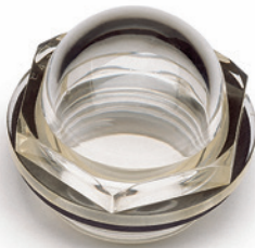
ELESAs Original design

Brass nut type GH. (see page 1372) for fitting to reservoirs with wall thickness smaller than 5 mm.